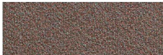
9522 L 40,68 / LRV 11,66