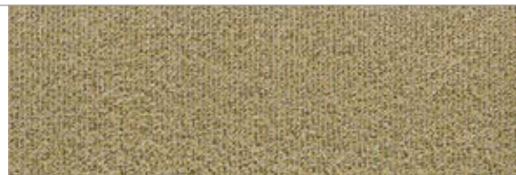
2917 L 56,69 / LRV 24,60