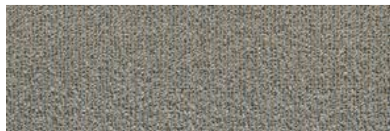
9096 L 52,20 / LRV 20,32