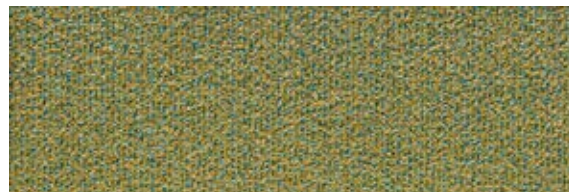
6313 L 55,94 / LRV 23,85