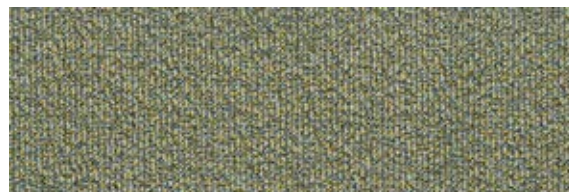
9505 L 49,23 / LRV 17,78