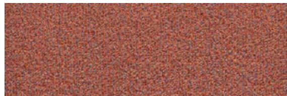
4431 L 45,77 / LRV 15,10